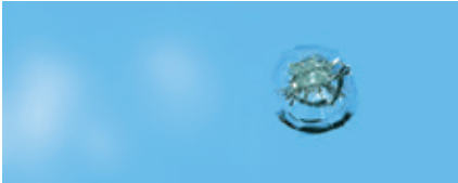
Cracked glass ( equal to or more than 1/2" in diameter) or spider cracks