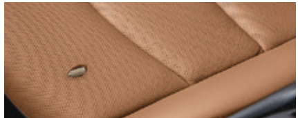
Upholstery holes more than 1/8"