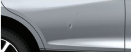
4 or more dings per panel