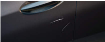
1 dent ( more than 4" ) or 1 scratch ( equal to or more than 6" ) per panel